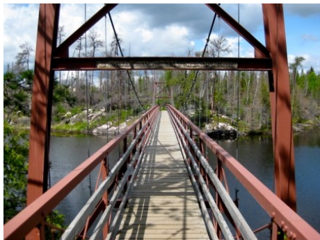
Cross the bridge of the master for daily worship.